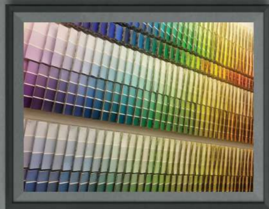
NCS VISIBILITY STAND