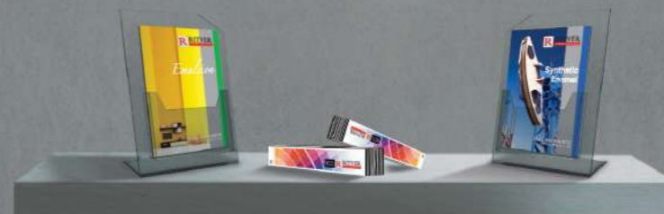
A SET OF CATALOGUES FOR NCS, RAL, RITVER ENAMEL & RITVER EMULSION