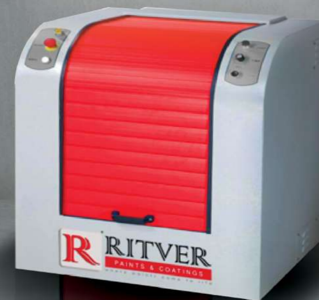
PAINT SHAKER UP TO 20 LITERS CAPACITY PACK