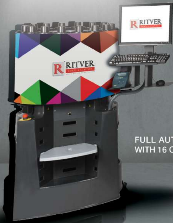
FULL AUTOMATIC TINTING MACHINE WITH 16 CANISTERS, 2 LITERS EACH.